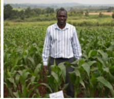
Agronomist (Also known as a Crop Doctor or Soil Scientist)