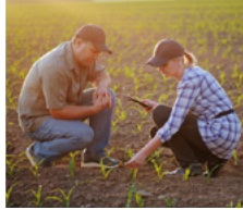
Crop Services Salesperson