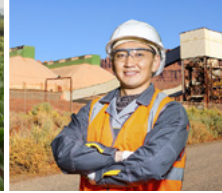
Potash Mine Operator